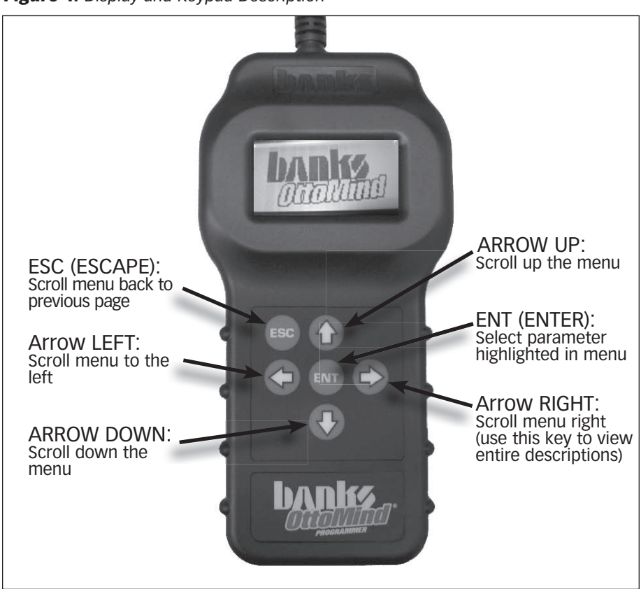
Figure 1: Display and Keypad Description

Familiarize yourself with Banks OttoMind keypad controls. The keypad will allow the user to navigate between screens and to select functions. (See Figure 1 ).