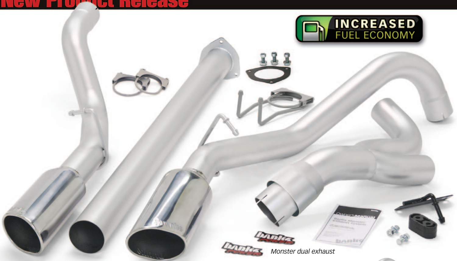
Monster dual exhaust