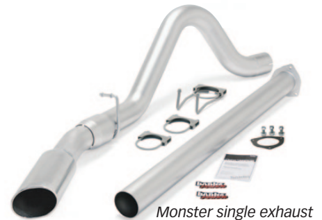
Monster single exhaust